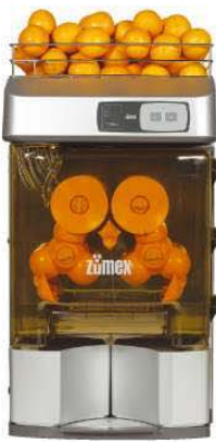
Zumex Versatile Silver