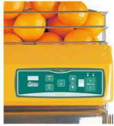
Detail of Zumex Versatile D