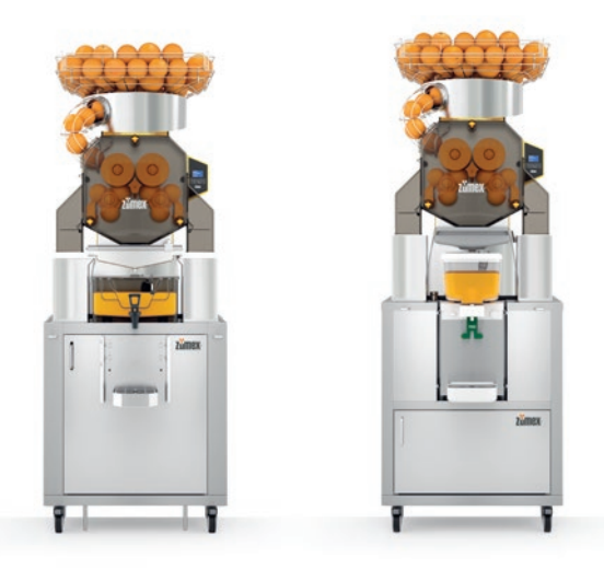
Speed Pro Tank Podium

Offer the best freshly squeezed juice to your customers and bring them a Life Essence experience.